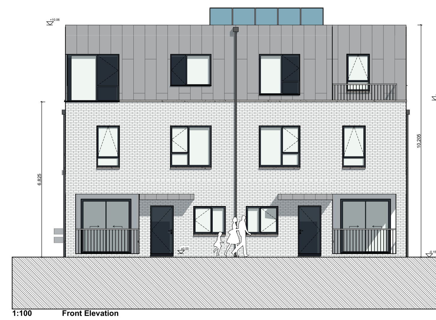
1:100 Front Elevation