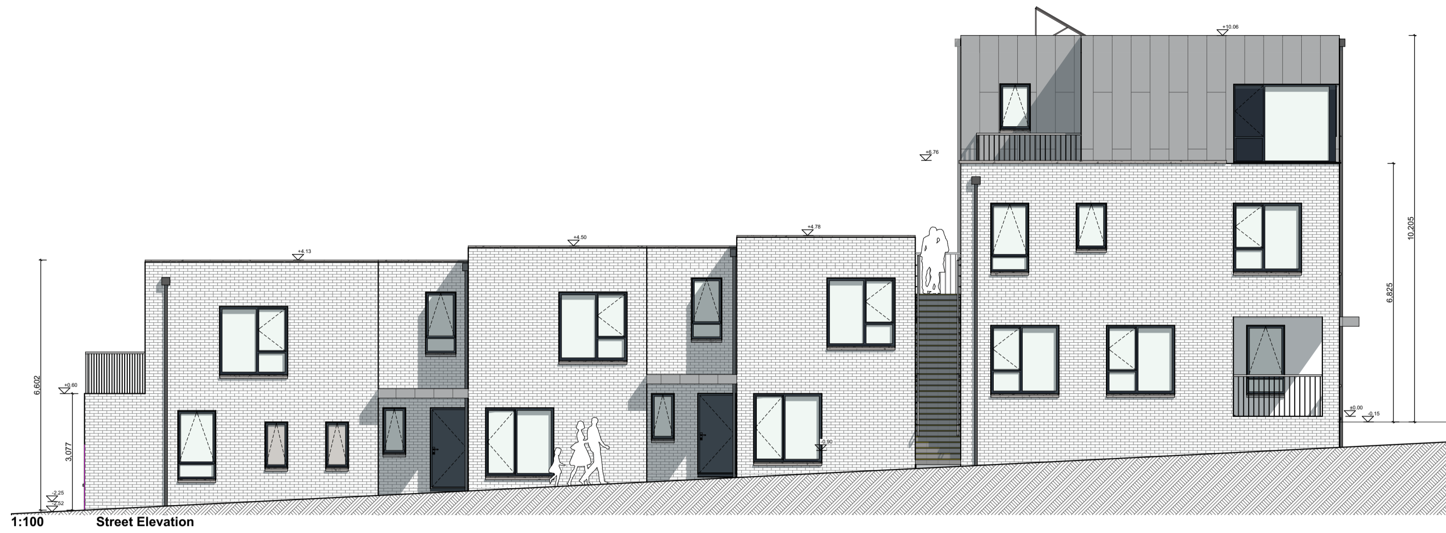
1:100 Street Elevation