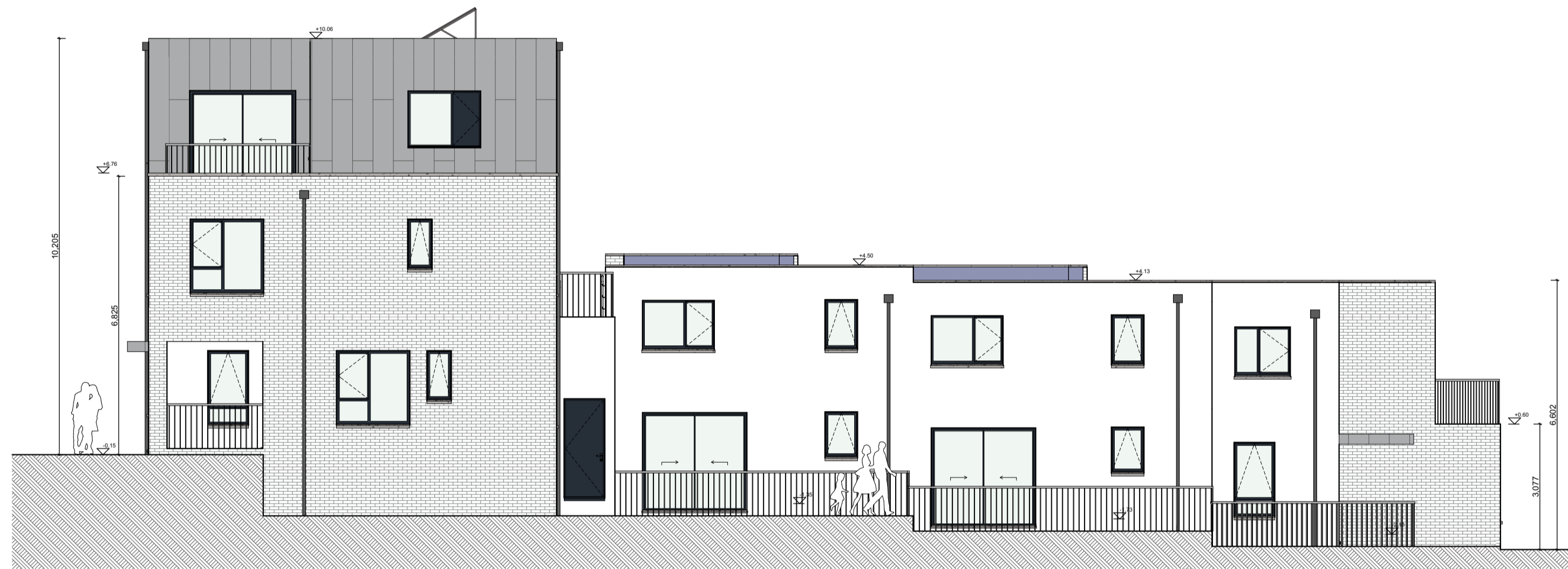
1:100 Communal Open Space Elevation