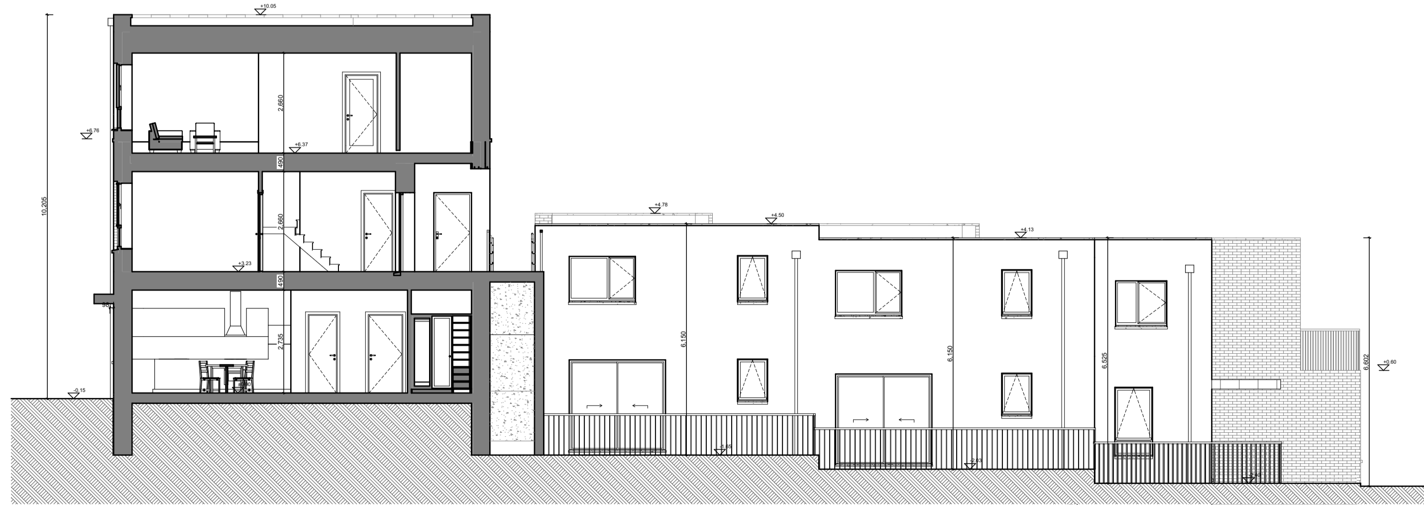
1:100 Section 01