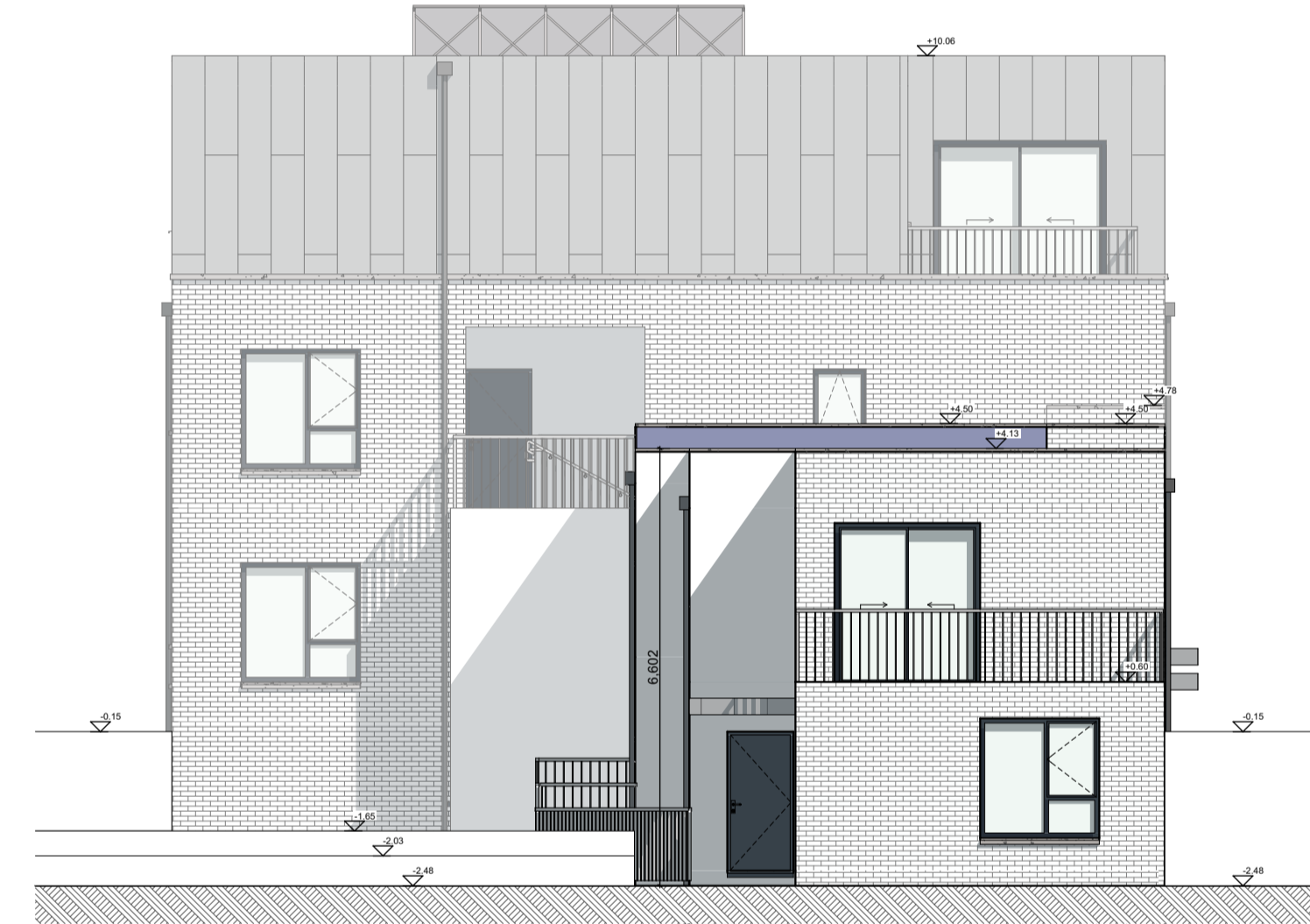
1:100 End Elevation